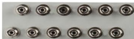
12 PORT FC SM SIMPLEX ADAPTER