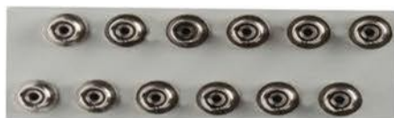
12 PORT FC SM SIMPLEX ADAPTER