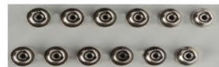
12 PORT FC SM SIMPLEX ADAPTER