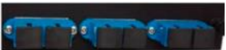
6 PORT SC DUPLEX ADAPTER