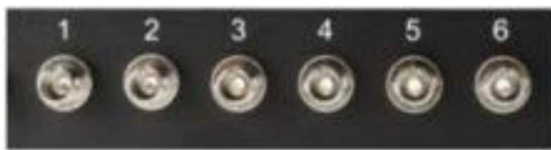
6 PORT ST SIMPLEX ADAPTER