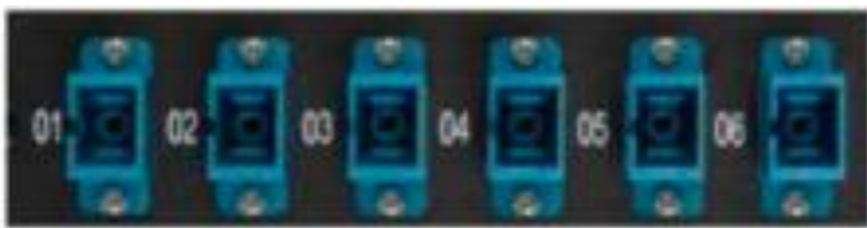
6 PORT SC SIMPLEX ADAPTER