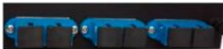
6 PORT SC DUPLEX ADAPTER